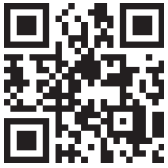
Video 2.3: Meta x and Visible Learning