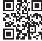
Video 2.2: Meta x and Feedback