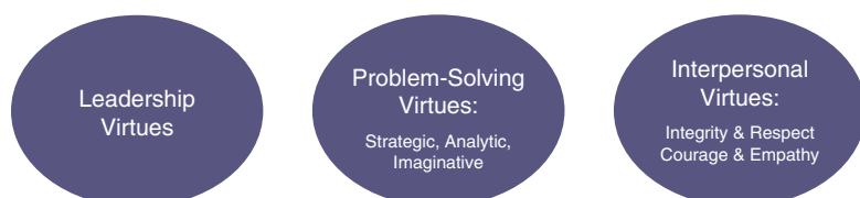
Figure 0.2 A Taxonomy of Virtues

Analytic virtues are apparent in leaders who are motivated to test rather than assume the validity of their own and others’ key beliefs, who are skilled in doing so, and who can explain why such testing is important to them. Virtuous leaders are very aware of the ethical dimensions of their decision-making—that mistaken assumptions and taken-for-granted beliefs can produce poor-quality decisions that waste resources, do not solve the problem, and may have negative impacts on students. The stance of leaders with strong analytic virtues is that of truth-seeking rather than truth-claiming.